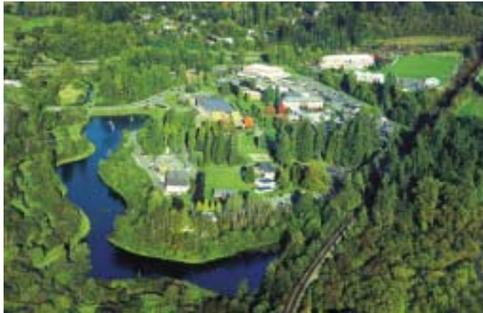
Trinity Western University's campus, in Langley, B.C., Canada